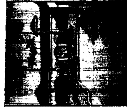
The Spa & Racquet Club at The Colony

lush, meticulously maintained landscaping will lead to your choice of grand tower residences, classic estate homes or romantic old world villas.