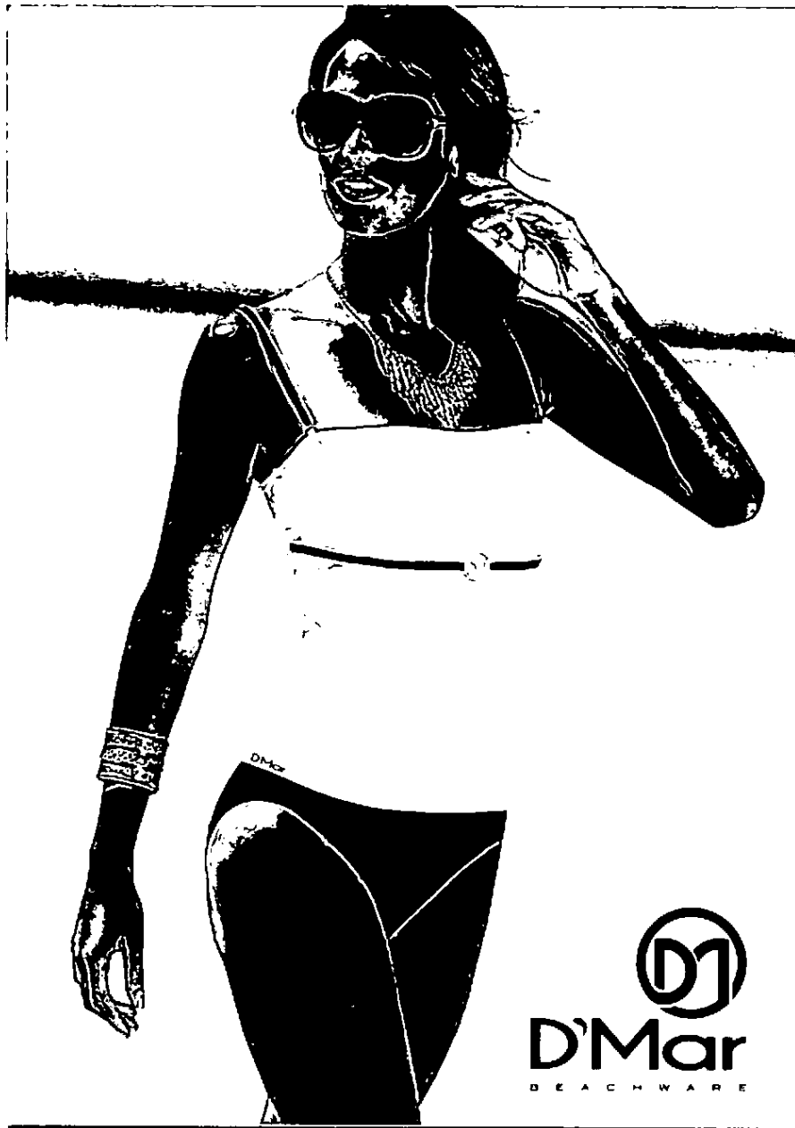
D'MAR 2-PIECE BATHING SUIT POSTER