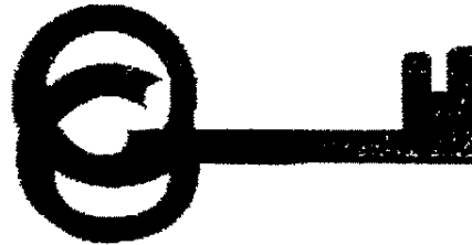
Stylized QG Mark

As you can see, the two stylized marks are impossible to confuse. The mark my client seeks to register is a stylized Q and a P. The mark registered on the principal register at the United States Patent and Trademark Office is a stylized Q and a G, combined in the form of a key.