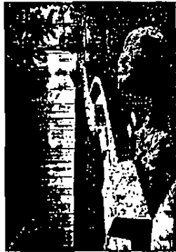
...of Biscayne National Park