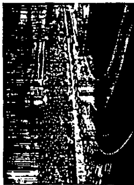
...of the Homestead-Miami Speedway