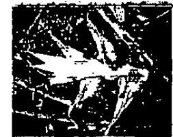
...to Tropical Climates