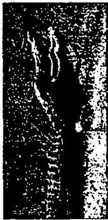
...of Everglades National Park