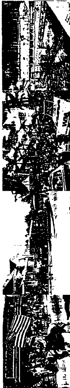
...to Quality of Life!