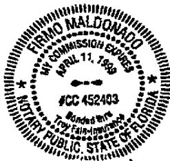
Notary Public State of Florida