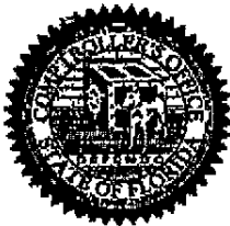
ROBERT F. MILLIGAN COMPTROLLER OF FLORIDA