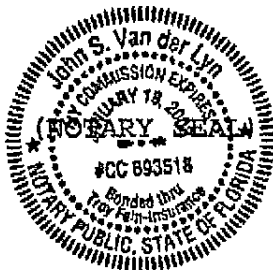
Notary Public, State of Florida at Large

FILED 99 FEB -8 PM 1:18 SECRETARY OF STATE TALLAHASSEE, FLORIDA