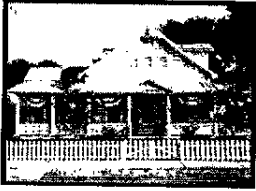
Located in the Historic Captain H. B. Jeffries Home