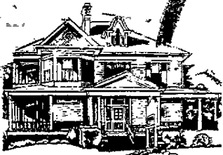
THE WATSON HOUSE 1903