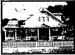
Located in the Historic Captain H. B. Jeffries Home