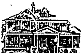
THE WATSON HOUSE 1903