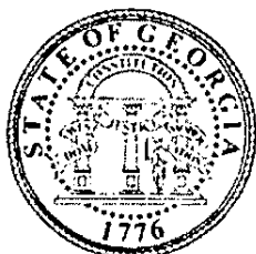
Brian P. Kemp Secretary of State

WITNESS my hand and official seal in the City of Atlanta and the State of Georgia on 04/03/2017