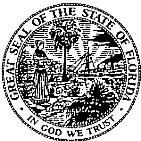
Laurel M. Lee

Given under my hand and the Great Seal of the State of Florida at Tallahassee, the Capital, this the Eleventh day of December, 2019