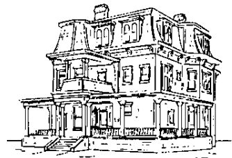
Hutchinson House - 1906

304 South Plant Avenue • Tampa • Florida 33606 813-254-4600 • fax 813-254-2226 • EPTInjurylaw.com