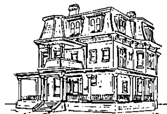
Hutchinson House - 1906

304 South Plant Avenue • Tampa • Florida 33606 813-254-4600 • fax 813-254-2226 • EatonandPowell.com