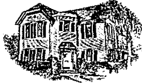
The Bassett House, circa 1884