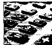
Charles Scher CPA

1900 CORPORATE BLVD., #400 EAST, BOCA RATON, FL 33431