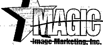
Image Marketing, Inc.