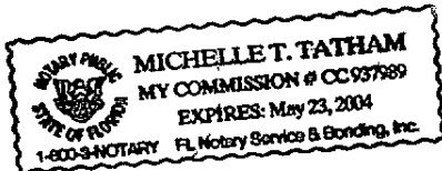
Notary Public State of Florida at Large

HAVING BEEN NAMED as registered agent for this corporation at the registered office designated in the foregoing Articles of Incorporation, the undersigned accepts the designation.