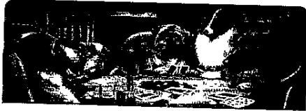
THE MESSER FAMILY 6011 Love Ridge Drive, Tallahassee, FL 32312