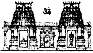
Shiva Vishnu Temple South Florida