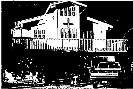
The World Bible Ministry Healing Outreach God's Place • 101 Ipswich Street Boca Raton, Florida 33487