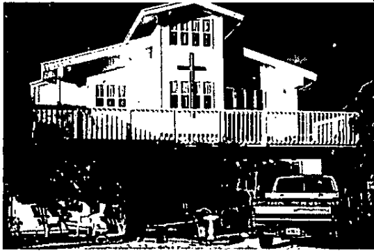
The World Bible Ministry Healing Outreach God's Place • 101 Ipswich Street Boca Raton, Florida 33487