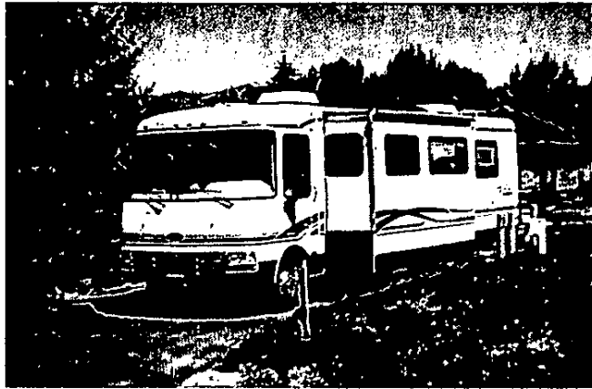
Chez Marie III

Department of State Division of Corporations PO Box 6327 Tallahassee, FL 32314