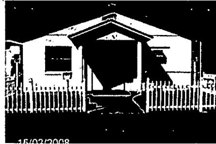
EMMANUEL CHURCH OF DELIVERANCE APOSTOLIC FAITH INC, NORTH TAMPA