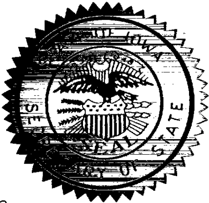
CHESTER J. CULVER SECRETARY OF STATE

I, CHESTER J. CULVER, secretary of state of the state of Iowa, custodian of the records of limited liability companies, certify that the limited liability company named on this certificate was duly organized under the laws of Iowa on the date printed above, that all fees required by the Iowa Limited Liability Company Act have been paid, and that articles of dissolution have not been filed.