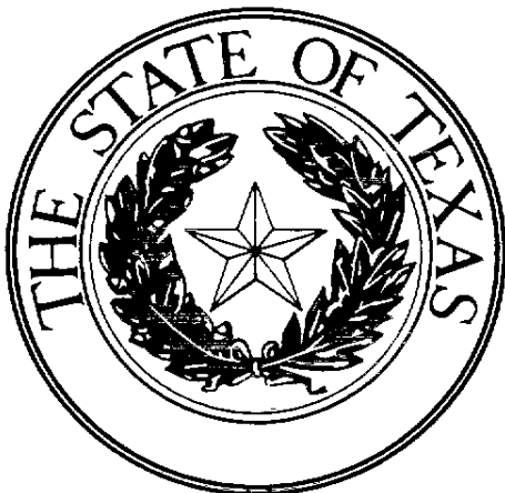
Alberto R. Gonzales Secretary of State

IN TESTIMONY WHEREOF, I have hereunto signed my name officially and caused to be impressed hereon the Seal of State at my office in the City of Austin, on December 30, 1997.