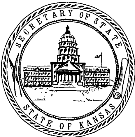
RON THORNBURGH SECRETARY OF STATE

In testimony whereof: I hereto set my hand and cause to be affixed my official seal. Done at the City of Topeka, this 19th day of September, A.D. 1997