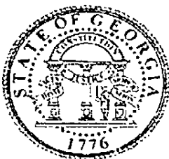
Brad Raffensperger Secretary of State

Docket Number : 26564666 Date Inc/Auth/Filed: 08/12/2020 Jurisdiction : Georgia Print Date : 01/29/2024 Form Number : 211