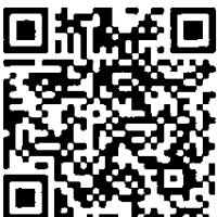
Deputy Registrar Belize Companies & Corporate Affairs Registry

Dated this 01 of February 2024 Certificate No. CERT-REQ-24/94160