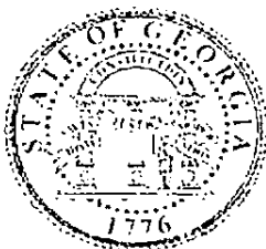
Brad Raffensperger Secretary of State

Docket Number : 26122408 Date Inc/Auth-Filed: 04/19/2023 Jurisdiction : Georgia Print Date : 10/03/2023 Form Number : 211