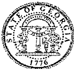
Brad Raffensperger Secretary of State

Docket Number : 25211273 Date Inc/Auth/Filed : 04/07/2023 Jurisdiction : Georgia Print Date : 05/26/2023 Form Number : 211