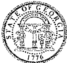
Brad Raffensperger Secretary of State

Docket Number : 24042338 Date Inc/Auth/Filed: 11/09/2022 Jurisdiction : Georgia Print Date : 11/14/2022 Form Number : 211