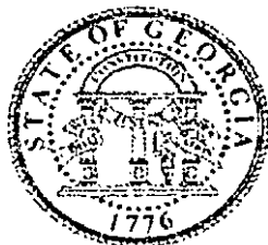
Brad Raffensperger Secretary of State

Docket Number : 23787831 Date Inc/Auth/Filed: 06/17/2014 Jurisdiction : Georgia Print Date : 10/25/2022 Form Number : 211