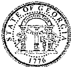
Brad Raffensperger Secretary of State

Docket Number : 23184839 Date Inc/Auth/Filed: 05/09/2022 Jurisdiction : Georgia Print Date : 05/11/2022 Form Number : 211