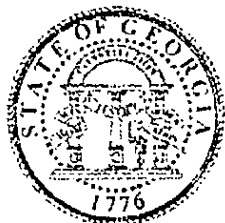
Brad Raffensperger Secretary of State

Docket Number 22011523 Date Inc/Auth/Filed 03/10/2009 Jurisdiction Georgia Print Date 10/05/2021 Form Number 211