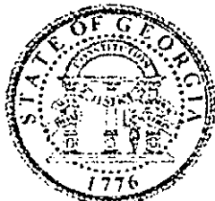
Brad Raffensperger Secretary of State

Docket Number : 20948572 Date Inc/Auth/Filed: 05/10/2021 Jurisdiction : Georgia Print Date : 05/20/2021 Form Number : 211