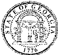
Brad Raffensperger Secretary of State

Docket Number : 20948613 Date Inc/Annl Filed: 05/12/2021 Jurisdiction : Georgia Print Date : 05/20/2021 Form Number : 211