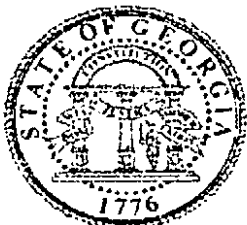
Brad Raffensperger Secretary of State

Docket Number : 19518694 Date Inc/Auth/Filed : 08/12/2020 Jurisdiction : Georgia Print Date : 08/14/2020 Form Number : 211