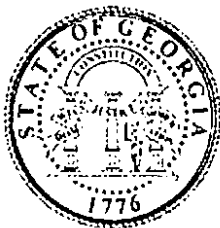
Brad Raffensperger Secretary of State

Docket Number : 18277986 Date Inc/Auth/Filed: 12/03/2019 Jurisdiction : Georgia Print Date : 01/09/2020 Form Number : 211