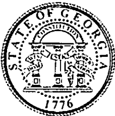
Brian P. Kemp Secretary of State

Docket Number : 16221477 Date Inc/Auth/Filed: 12/19/1997 Jurisdiction : Georgia Print Date : 09/11/2018 Form Number : 211