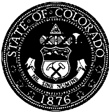
Secretary of State of the State of Colorado

I have affixed hereto the Great Seal of the State of Colorado and duly generated, executed, and issued this official certificate at Denver, Colorado on 02/28/2018 @ 16:19:58 in accordance with applicable law. This certificate is assigned Confirmation Number 10750937 .