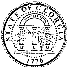
Brian P. Kemp Secretary of State

Docket Number : 15418332 Date Inc/Auth/Filed: 06/09/2015 Jurisdiction : Georgia Print Date : 03/02/2018 Form Number : 211