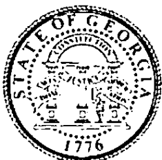
Brian P. Kemp Secretary of State

Docket Number : 15498147 Date Inc/Auth/Filed: 08/26/2009 Jurisdiction : Georgia Print Date : 03/13/2018 Form Number : 211