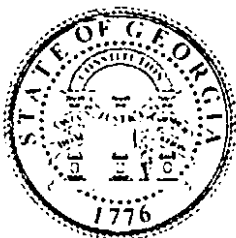
Brian P. Kemp Secretary of State

Docket Number : 15095207 Date Inc/Auth/Filed: 02/22/2005 Jurisdiction : Georgia Print Date : 01/13/2018 Form Number : 211