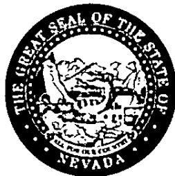
Barbara K. Cegavske Secretary of State

Electronic Certificate Certificate Number: C20170810-0600 You may verify this electronic certificate online at http://www.nvsos.gov/