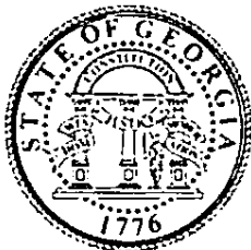
Brian P. Kemp Secretary of State

Docket Number : 14764403 Date Inc/Auth/Filed: 05/27/2005 Jurisdiction : Georgia Print Date : 07/21/2017 Form Number : 211