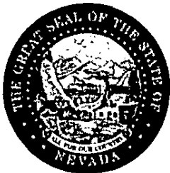
Barbara K. Cegavske Secretary of State

Electronic Certificate Certificate Number: C20170521-0081 You may verify this electronic certificate online at http://www.nvsos.gov/