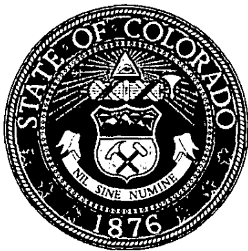
Secretary of State of the State of Colorado

I have affixed hereto the Great Seal of the State of Colorado and duly generated, executed, and issued this official certificate at Denver, Colorado on 03/03/2017 @ 14:43:07 in accordance with applicable law. This certificate is assigned Confirmation Number 10110932