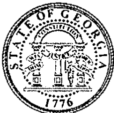
Brian P. Kemp Secretary of State

Docket Number : 14123248 Date Inc/Auth/Filed : 01/16/1990 Jurisdiction : Georgia Print Date : 02/28/2017 Form Number : 211